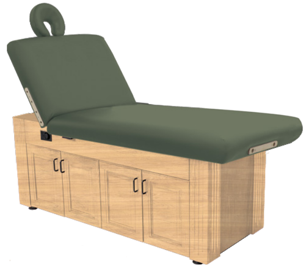
M100-LB-3007 with Raised Panel Doors and True Touch Upholstery