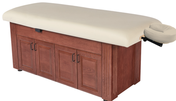
M100-B-3007 with Raised Panel Doors and Cinnamon Stain