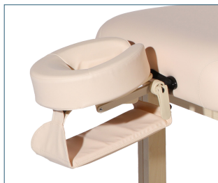
Solutions Classic Adjustable Face Rest & Crescent Pillow with Front Arm Sling