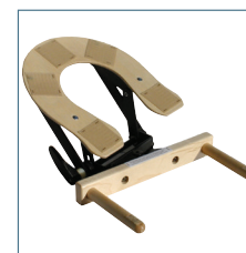
UP PPOS-B - Upgrade from Dual Action Face Rest Base to Pivot Posi-tilt. Full range of adjustment is 4-6" and pivots 30° in either direction.