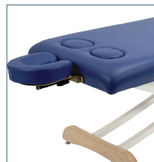
Breast Recesses Option - Breast/Scapula Recesses include dual cutouts with central sternum/spine support (includes custom plugs)