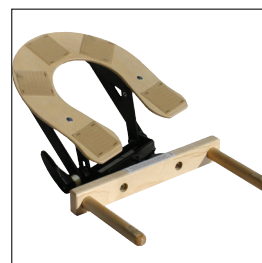
UP PPOS-B - Upgrade from Dual Action Face Rest Base to Pivot Posi-tilt. Full range of adjustment is 4-6" and pivots 30° in either direction.