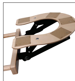
UP DPOS-B - Upgrade from Dual Action Face Rest Base to Deluxe Adjustable. Full range of adjustment is 4-6".