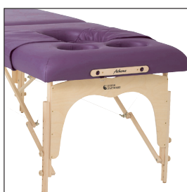
PG - Prenatal Option - Breast Recesses and belly cutout with adjustable sling to provide comfort and support to expectant mothers of any size (includes custom plugs)