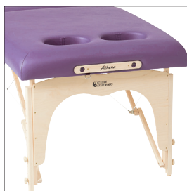
BR - Breast Recesses Option - Breast/Scaupula Recesses include dual cutouts with central sternum/spine support (includes custom plugs)